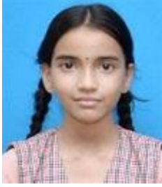
Avarthana VI C