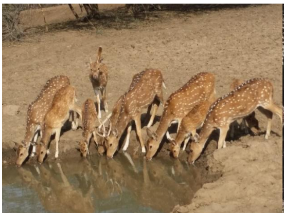
Spotted deer drinking water from a water hole