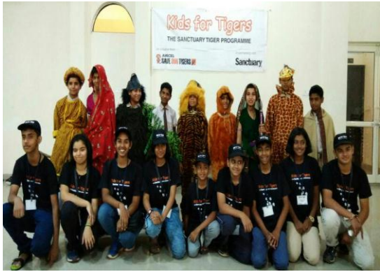
Tiger ambassadors with rural kids of Ranthambore who performed a street play