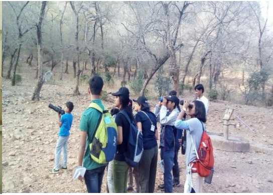
Bird watching session