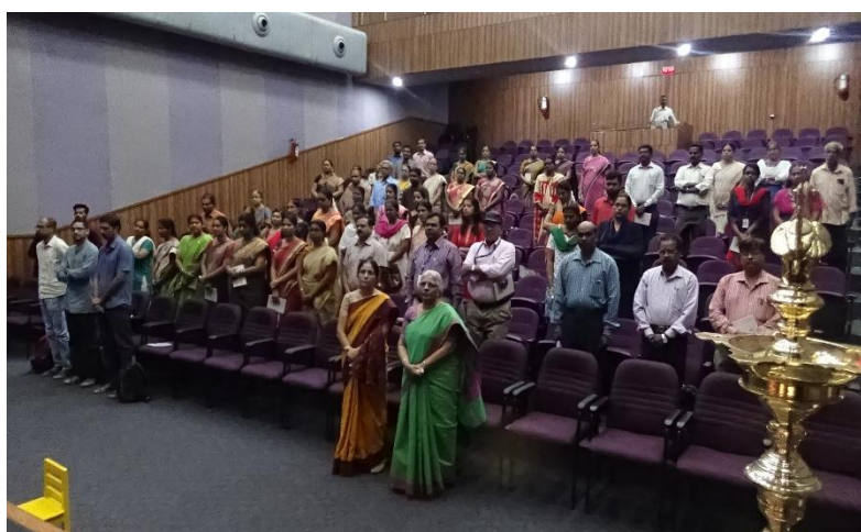
Inaugural Session- Prayer