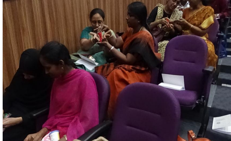
Teachers engrossed in hands –on activity