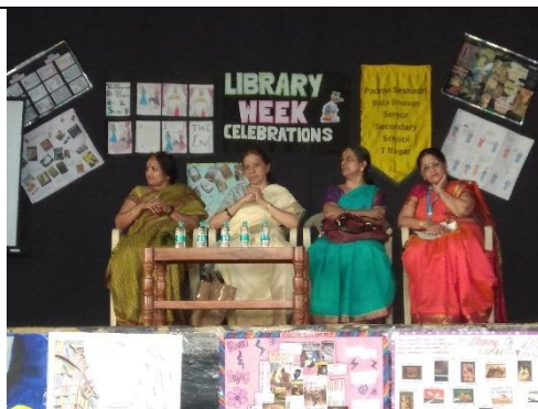
Dignitaries on the dais