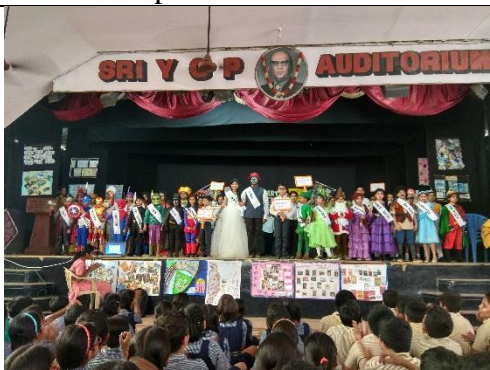
Character Parade – 53 characters on stage from Std. 1 to 8