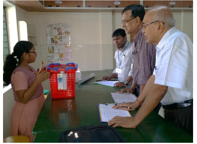
JeevitaKrsna (6D)- Automated shopping basket