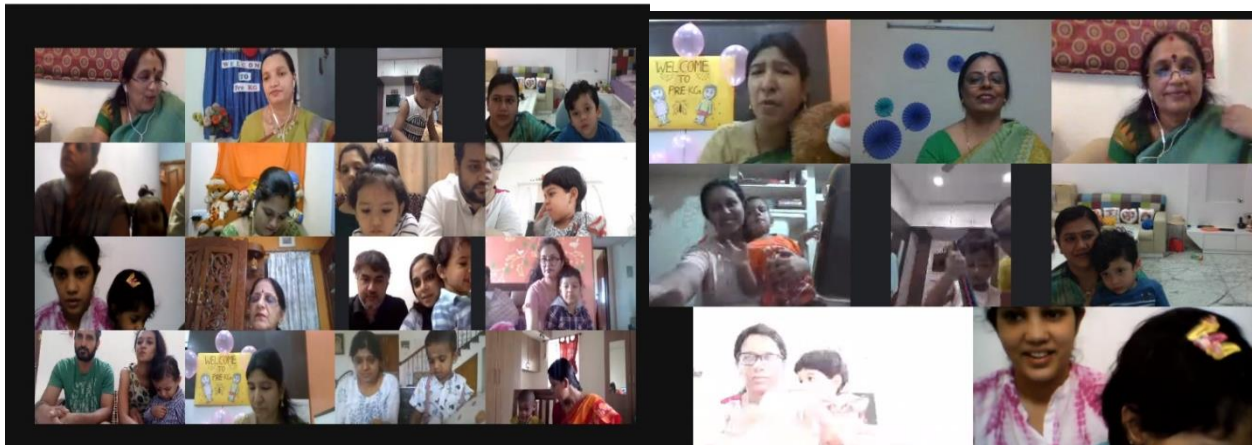
Tiny Tots enjoying the rhymes session

Being an auspicious day, the teachers began the first interaction with the tiny tots with a rhyme session.