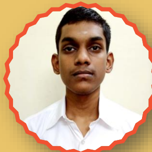
S Sarvesh X C