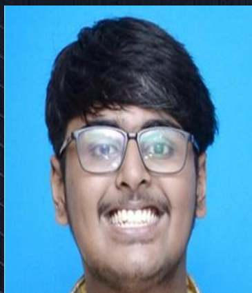
S NAREN XIB