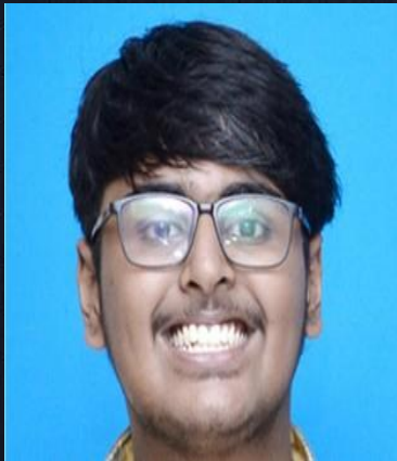
S NAREN XIB