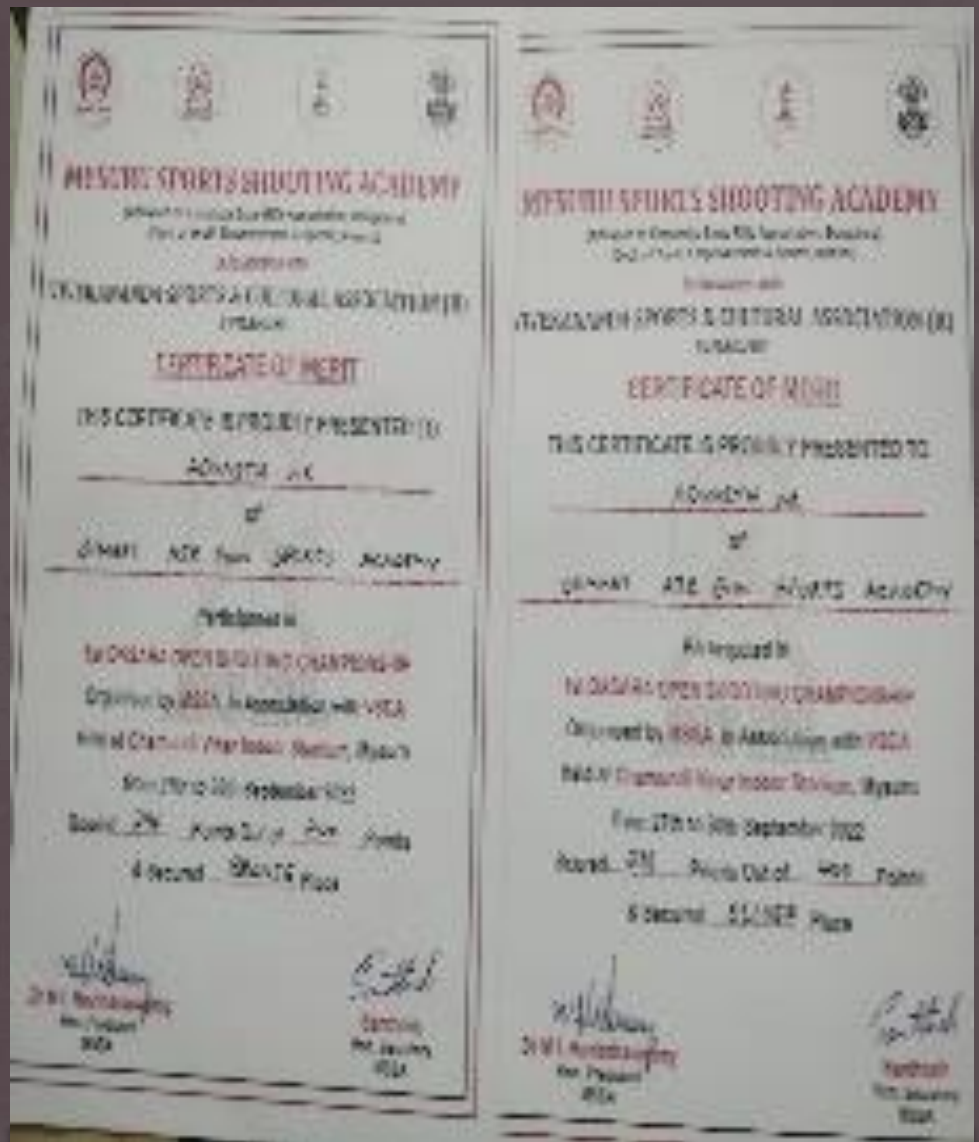
Certificate of Merit